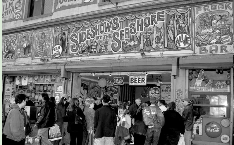
Renovations to Coney Island USA’s landmark building will encourage more people to visit this unique part of Brooklyn.