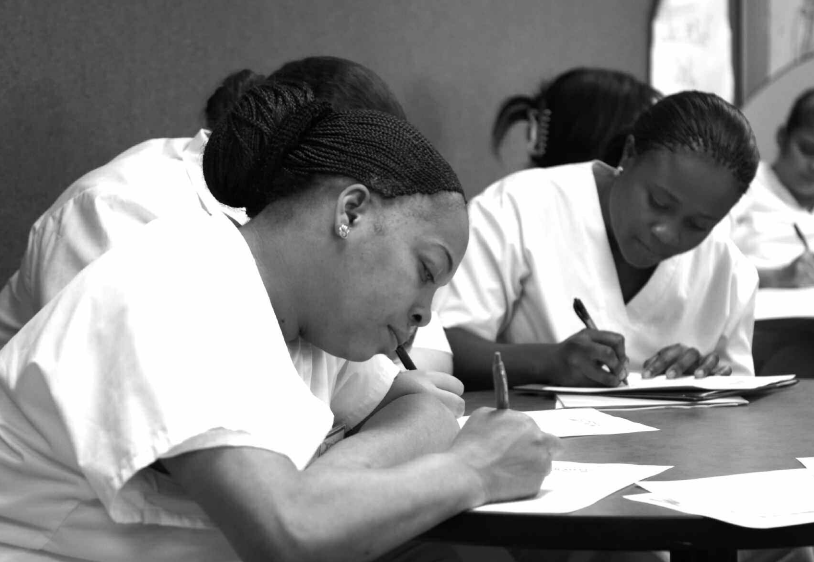
Women learn to provide quality home care at the Paraprofessional Healthcare Institute.

Licensed family day care is one option. Provided by women in their homes, it usually offers flexible hours at low cost. And doubling the bang for the buck, it is a business that can be run by young women who are home caring for their own children. To help these microentrepreneurs manage and develop their business, the Business Outreach Center Network —which gives loans, training, and advice to minority, immigrant, and female entrepreneurs—has, over the last two years, prepared 154 women to start new family day care businesses, and helped 150 existing providers expand. With our $94,000 grant, the Network will now offer family child care business development services on the Lower East Side and in Chinatown. And to help ensure that providers are offering high-quality services, the Network will work with the New York City Early Childhood Professional Development Institute at CUNY to run a 10-hour workshop series on child development and visit providers' homes to see if participants are using what