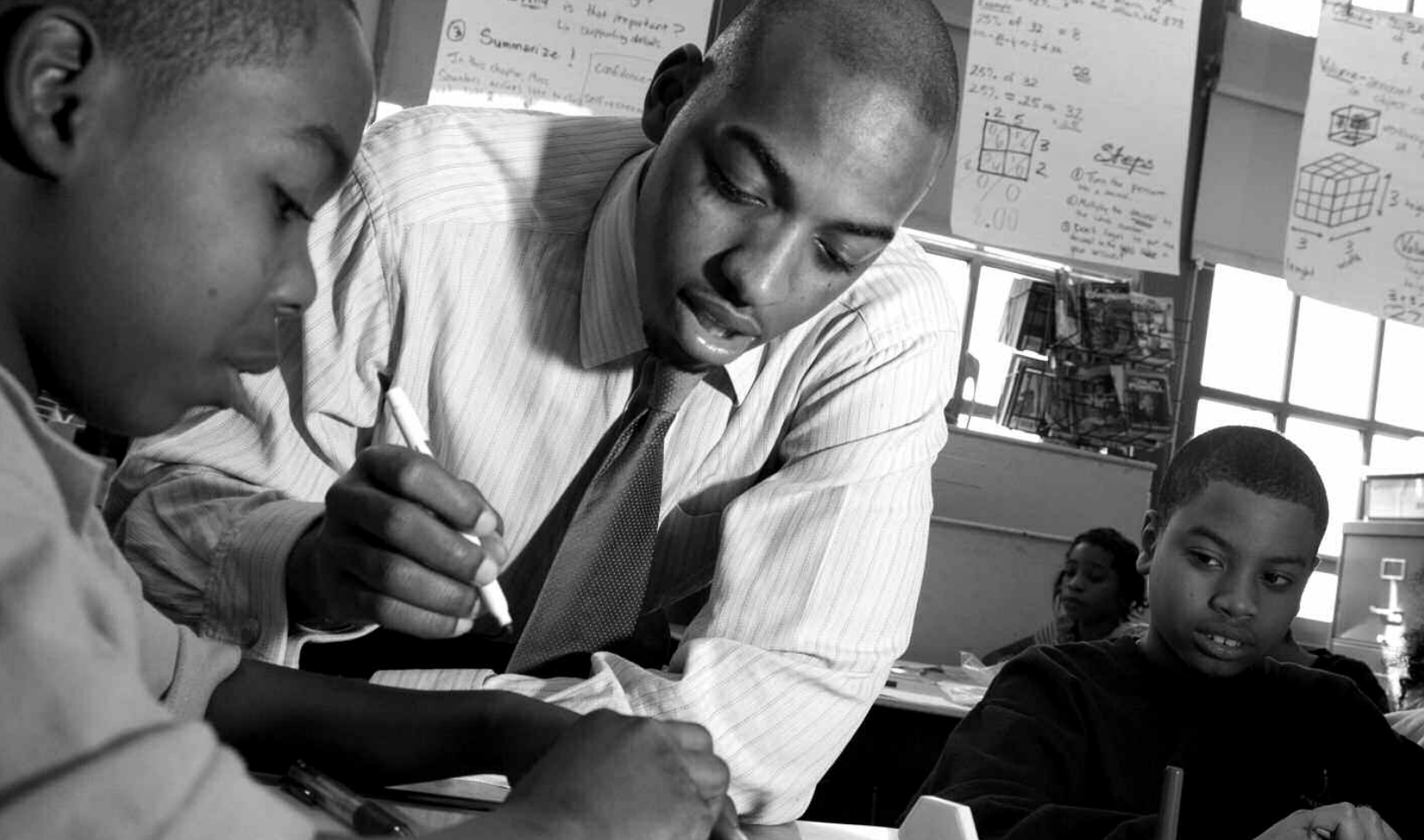
A Teach For America corps member in a New York City public school.

Museum's PlayWorks center. Once completed, workshop participants get a membership to the museum for the year, meaning lots of free field trips!