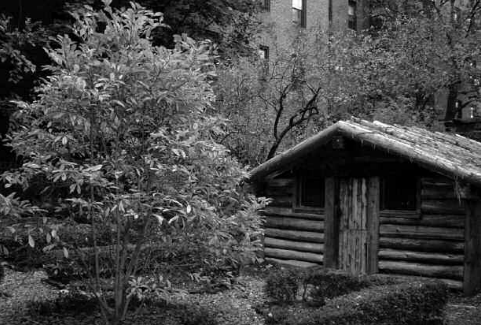
Hessian Hut at the Dyckman Farmhouse Museum, located in Manhattan.