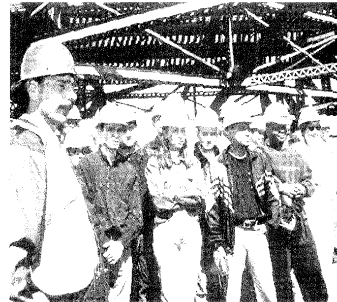
Students on an annual spring field trip.

In an effort to encourage young people to consider heavy construction as a career, the Moles in 1956 held a seminar for college engineering undergraduates. The success of the seminar encouraged members to have a regular education program. Each spring since, the Moles have hosted a field trip to a major heavy construction project in the New York metropolitan area for students from participating schools to see firsthand the work in progress.