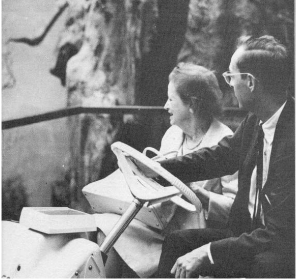
A guided tour through the World of Birds at the Bronx Zoo delights the woman who made it possible. Sloping ramps connect the building's two levels of natural settings—hillside, swamp, desert, and rain forest—where more than 100 species of birds can be seen.